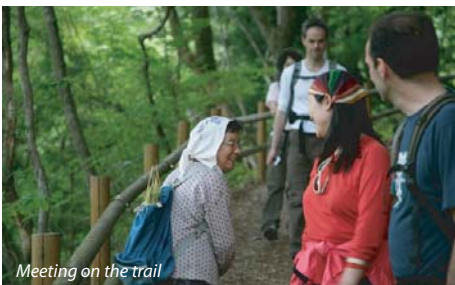
Meeting on the trail

From Nara our journey takes us to the ridge top village of Yoshino, and a comfortable ryokan. We will visit Mikumari Shrine and Kinpusenji Temple (main temple of the Shugendo sect of mountain monks), and explore the area on foot.