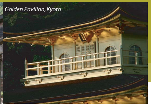
Golden Pavilion, Kyoto