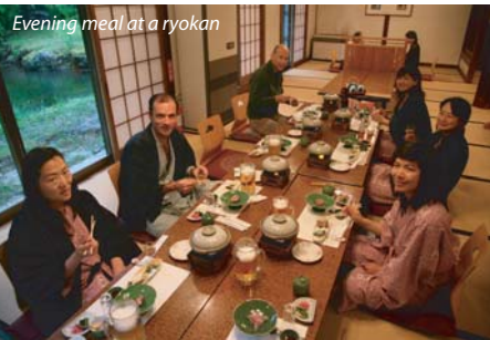
Evening meal at a ryokan

From Yoshino we will take the scenic train to Mount Koya, situated in a bowl-shaped valley filled with stands of cedar trees 800 metres up in the mountains of the Kii Peninsula. Since the 9th century, when the monk Kukai (also known as Kobo Daishi) founded the first temple and the shingon sect of Buddhism, Mount Koya has been a place of religious devotion and ceremony. Today there are more than 100 monasteries, many of which have