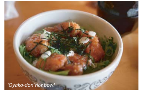
'Oyako-don' rice bowl

On our final day, we will say farewell in Kyoto, or you may like to stay a few days longer.