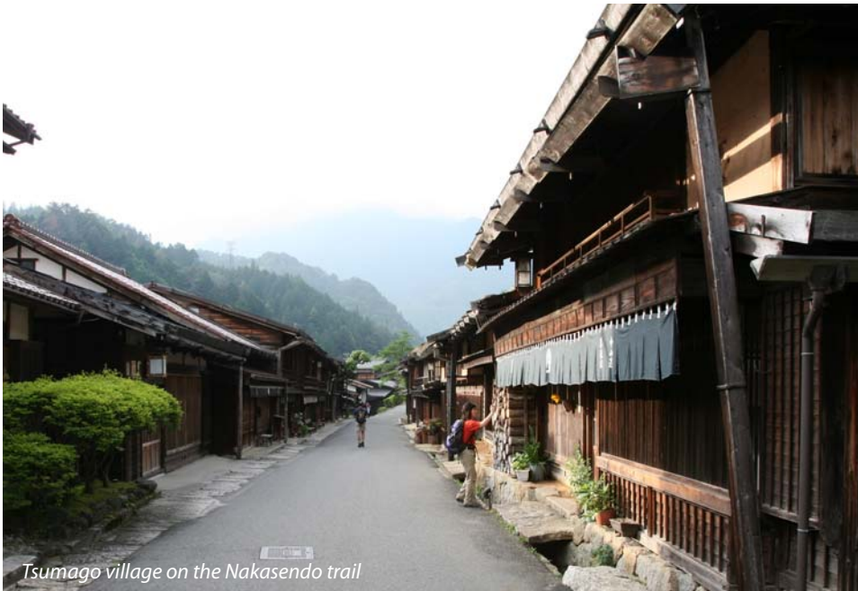
Tsumago village on the Nakasendo trail

12 days guided village-to-village walking tour from Tokyo to Kyoto. Accommodation in family-run minshuku, traditional ryokan, shukubo (pilgrims lodges) and hotels.