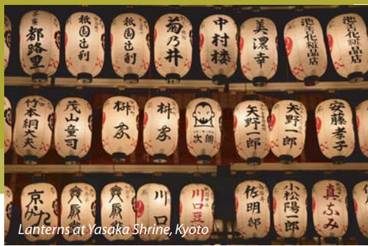
Lanterns at Yasaka Shrine, Kyoto