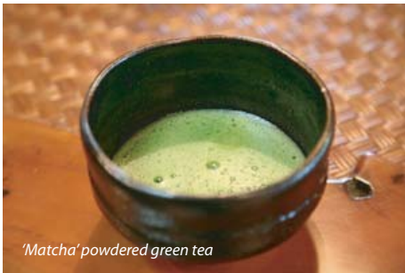
'Matcha' powdered green tea

In the morning we will have a guided walk in Nara. Many of Japan's greatest cultural treasures are concentrated in and around the city, with eight UNESCO World Heritage sites. The Todaiji temple, Nigatsu-do and Sangatsu-do halls, Kasuga shrine, Shinyakushi-ji temple, Kofuku-ji temple, Shosoin treasure house, and Isuien garden are all in or near Nara Park. The park is also home to a thousand or more free-roaming deer. Todaiji's Daibutsu-den is the largest wooden building in the world, and houses a 16-metre tall bronze image of the cosmic Dainichi buddha, containing 437 tonnes of bronze and 130kg of gold. Prior to being rebuilt three hundred years ago, the awesome structure was even bigger than it is today. There will be time to relax or wander through the old town.