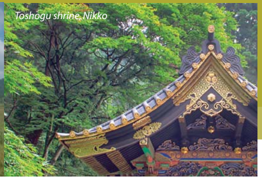
Toshogu shrine, Nikko

lunch of onigiri (rice balls flavoured with Japanese pickles), and then continue to the northern edge of the marsh, where a bus will take us through a long valley to the Okutadani lake and a boat ride to the opposite side. Another short bus ride will bring us to Tochio hot spring, where we will stay for the night in a lovely traditional ryokan, enjoying a dip or two in the open-air hot spring baths.