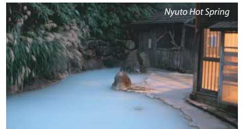
Nyuto Hot Spring

On our final day we say farewell. Your tour leader will help you transfer to Tokyo's Narita airport for your flight home, or you may like to stay a few day's longer.