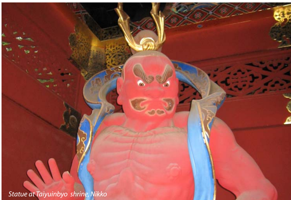
Statue at Taiyuinbyo shrine, Nikko

13 days guided walking tour visiting Tokyo and northern Japan. Accommodation in family-run minshuku, traditional ryokan, shukubo (pilgrims lodges) and hotels.