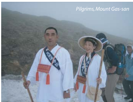
Pilgrims, Mount Gas-san

At the summit, we will be purified by the wave of a priest's shide (ceremonial wand) and finish our visit to the shrine with a drop of the sacred drink – sake. After a picnic lunch, we will retrace our steps down the mountain and head by road to Gyokusenji temple. Said to have been founded in 1251 by the Zen monk Ryonen Homyo Zenji, the temple is complemented by a garden completed in the 1650s and now designated as a National Place of Scenic Beauty. We will take a peaceful moment to enjoy the view of the garden with the option of participating in the tea ceremony. From Gyokusenji we will return to our lodgings for dinner.