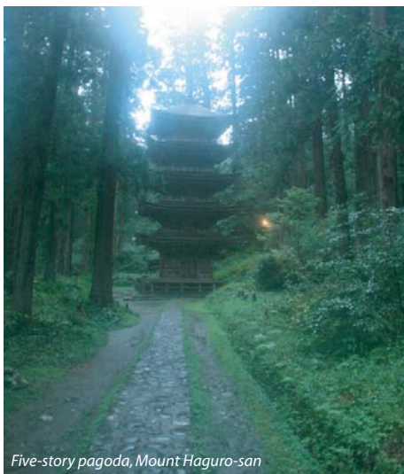
Five-story pagoda, Mount Haguro-san

The summit of Haguro-san is reached by a staircase of 2,446 stone steps surrounded by a forest of giant cedars. At the top the pilgrims in their white coats head for the Dewa Sanzan shrine with its massive thatched roof. Connected to the shrine by a covered walkway is the lovely 'sanrojo' (lodgings in temples originally for pilgrims) where we stay tonight. Our baggage sent from Nikko will be waiting for us when we arrive. For dinner we will enjoy a meal of shojin-ryori , vegetarian cuisine.